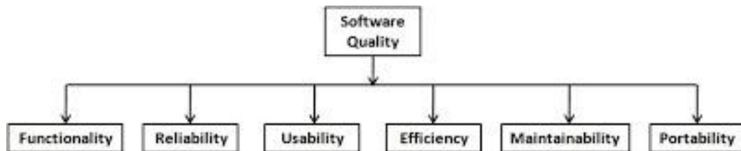
Figure 1.1: Software quality attributes.

These attributes can be defined as follows: